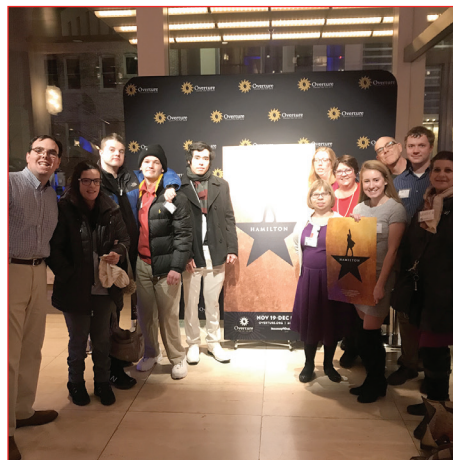
Hamilton was an impacting event for all. It surely changed lives of those attending.