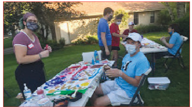
AHTAFI helped sponsor an IHM workshop this summer. We were able to spend creative time together outside in a safe way.