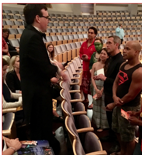
The cast stayed late answering questions and encouraging us.